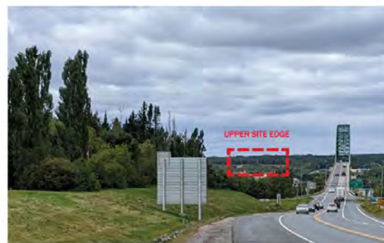
Views from Centennial Bridge