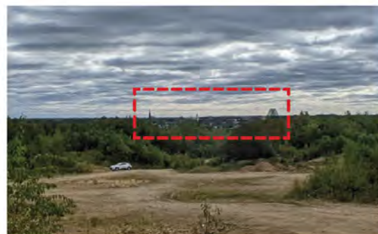
Views from Site